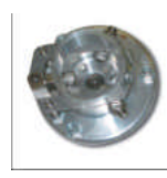
Quick Coupler System