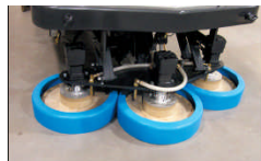
Velcro Drivers/Splash Guards

Coverage per Hour: Up to 96,000 sq. feet